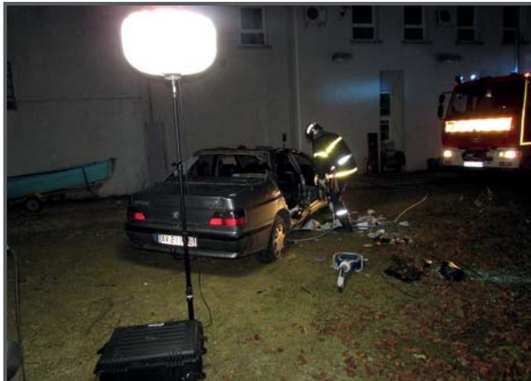
▶ Rescue Operations