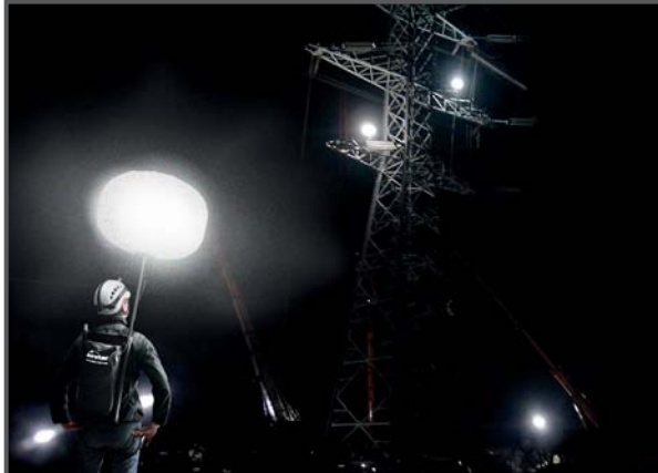
▶ Industrial Maintenance (Backpack Free Hands)