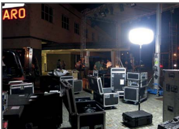
▶ Night Work Fast Lighting